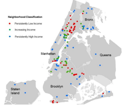
Exhibit 2-1: Map of NYCHA developments in citywide quantitative analysis by surrounding neighborhood classification